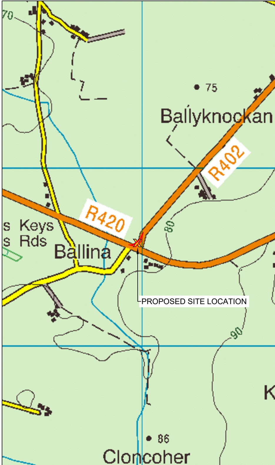
SITE LOCATION SCALE 1:12,500