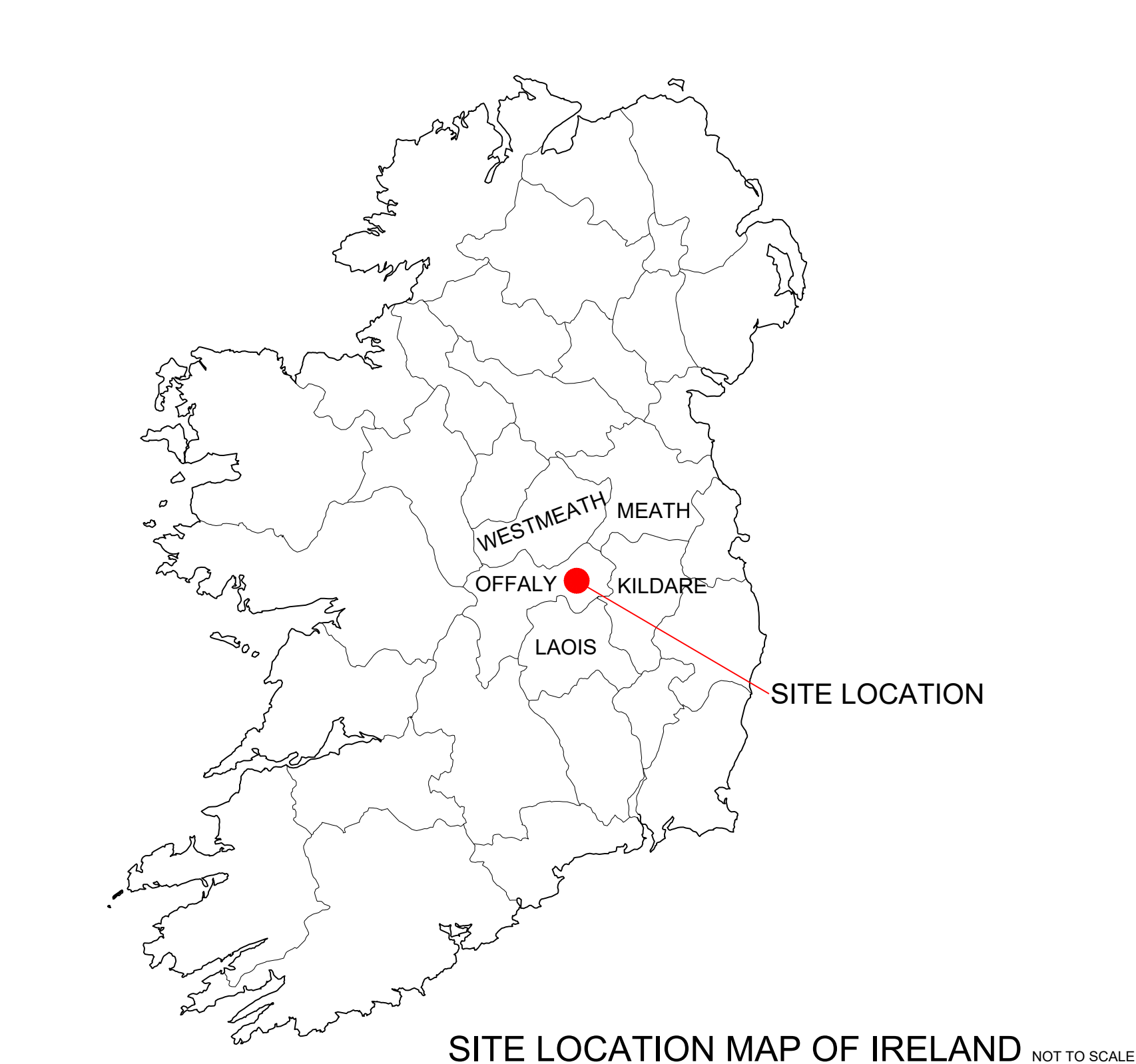
SITE LOCATION MAP OF IRELAND NOT TO SCALE